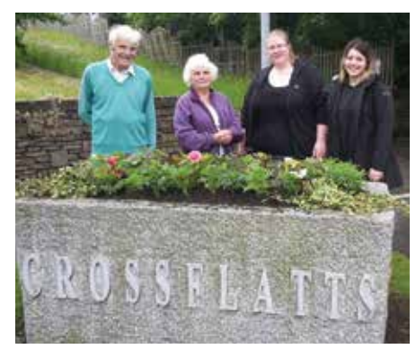
Crossflatts planting in progress

The Council's Green and Clean Forum on 10th June included discussion about winter planting and a presentation from Northern Rail. A formal application has now been made to adopt both Bingley and Crossflatts stations, and a group of twelve people have already signed up to start a planned programme to make them more attractive to residents and visitors alike.