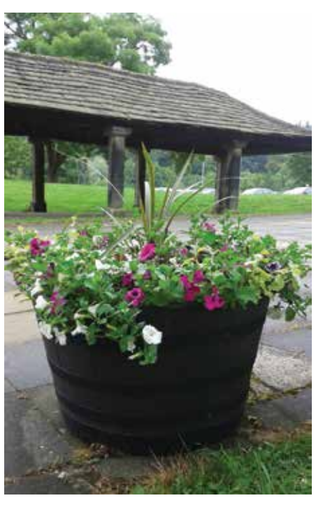
Floral Display in Bingley Town centre

In June, village societies and other volunteer groups planted out the begonias, geraniums, dahlias and marigolds purchased by the Town Council from Bradford Council.