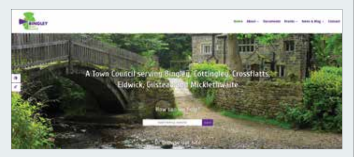
The Town Council's website

All Council meetings and events are listed, and relevant documents - agendas, minutes and supporting documents – are available for download. You can also get details of your local councillors and find out which committees they are active on. Regular news items provide updates on Council activities, to add to information provided on the Council's Facebook page and printed newsletters.